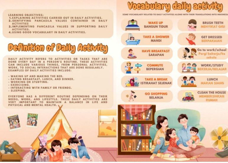
Figure 2. Content of the Book

Always check that the content design includes accessibility options. For example, the flipbook should allow students to adjust font sizes, toggle high contrast modes, or activate text-to-speech functions. The interactive elements should be easy to activate, even for students with limited dexterity. When designing quizzes and exercises, ensure there are multiple answer formats (such as multiple-choice, text, and image-based questions) to accommodate different learning styles.