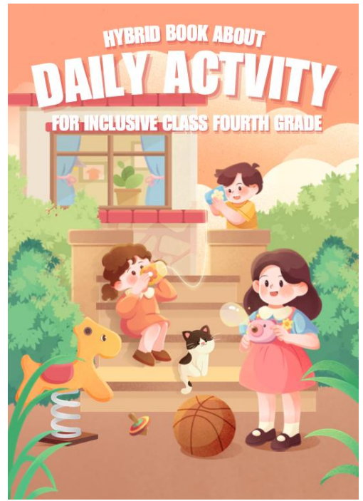
Figure 1. Making The Cover